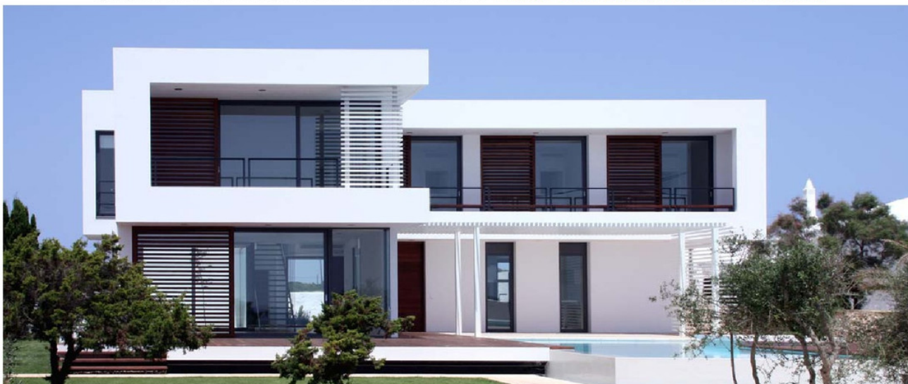
Ejemplo de diseño de Villa para la parcela Torremuelle P21 * Example of a Villa design for plot Torremuelle P21