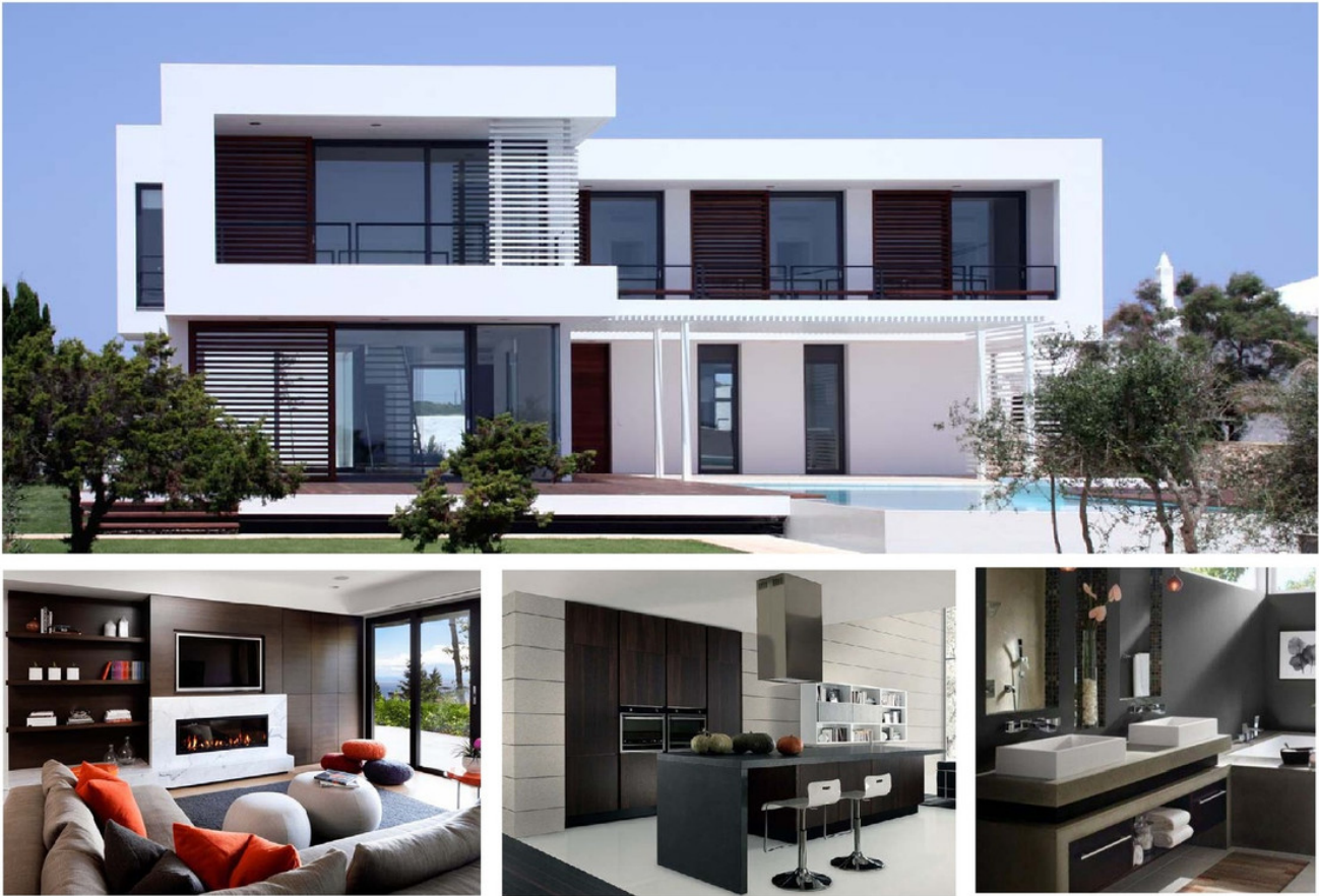
Ejemplo de diseño de Villa para la parcela Torremuelle P21 * Example of a Villa design for plot Torremuelle P21