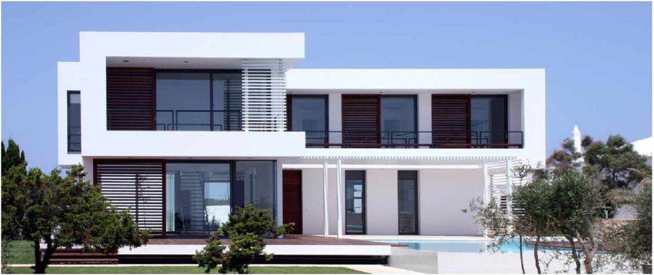
Ejemplo de diseño de Villa para la parcela Torremuelle P21 * Example of a Villa design for plot Torremuelle P21