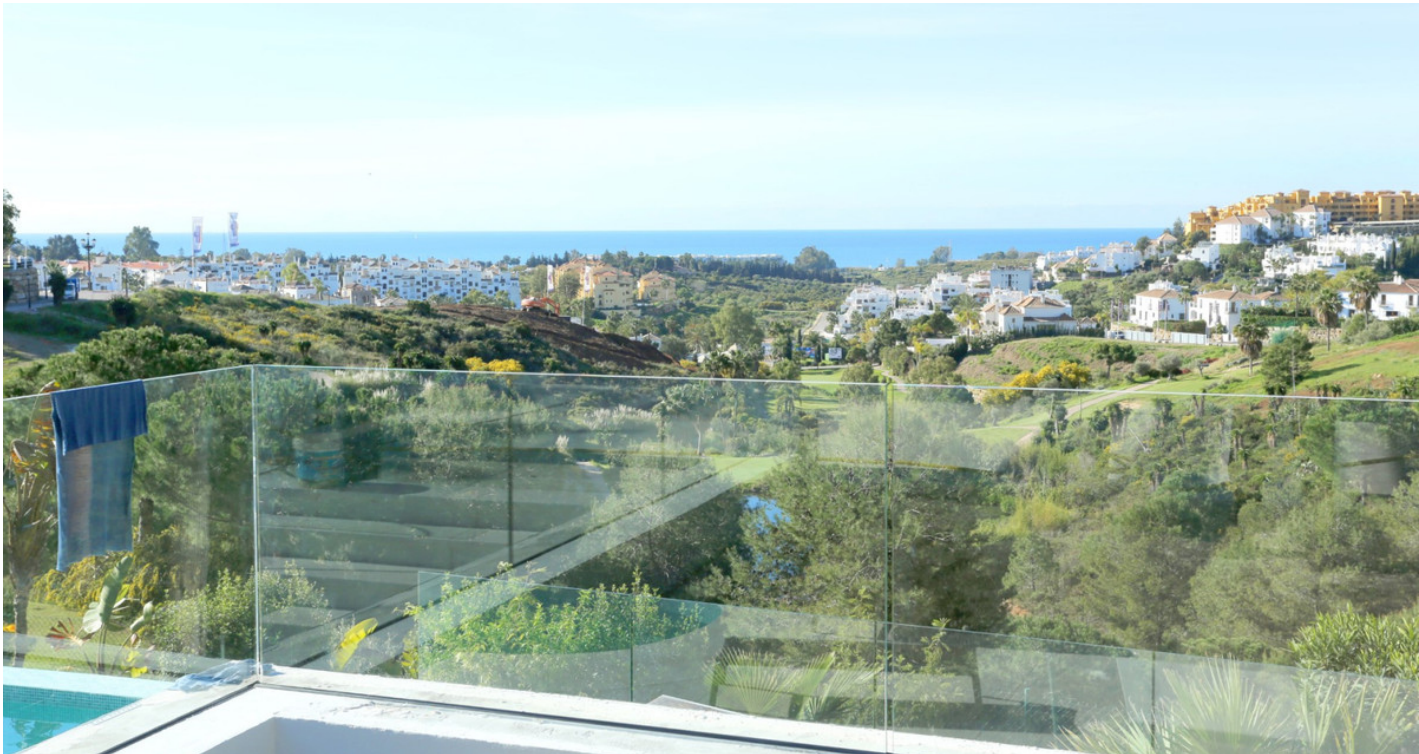
Photos from the villa next door, simulating the views from the terrace of the new villa.