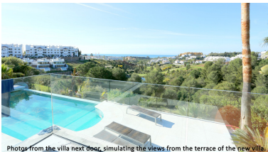
Photos from the villa next door, simulating the views from the terrace of the new villa.