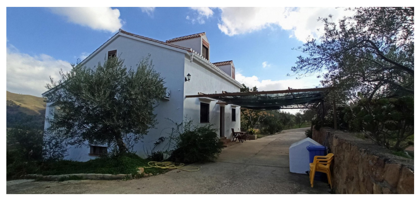
Bedrooms: 5Bathrooms: 2M²: 321Price: 295,000 €Status: SaleProperty Type: Rustic house Parking places: by requestPrinting day : 27th August<br/>2025