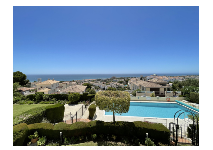
Price: 249,000 € Printing day : 1st September 2025

M<sup>2</sup>: 77 Parking places: by request