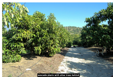
avocado plants with olive trees behind