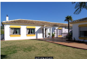
north wing and patio