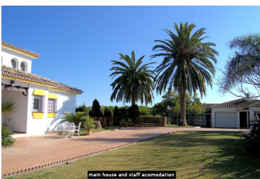
main house and staff acomodation