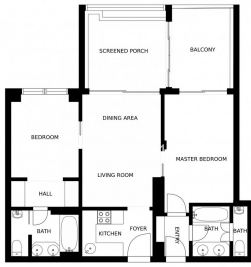
SIZE AND DIMENSIONS ARE APPROXIMATE, ACTUAL MAY VARY.