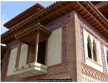
Architectural details on West and South facade