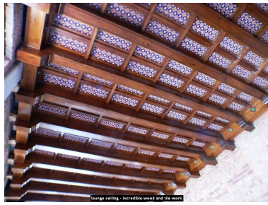
Geometric ceiling - intricate wood and tile work